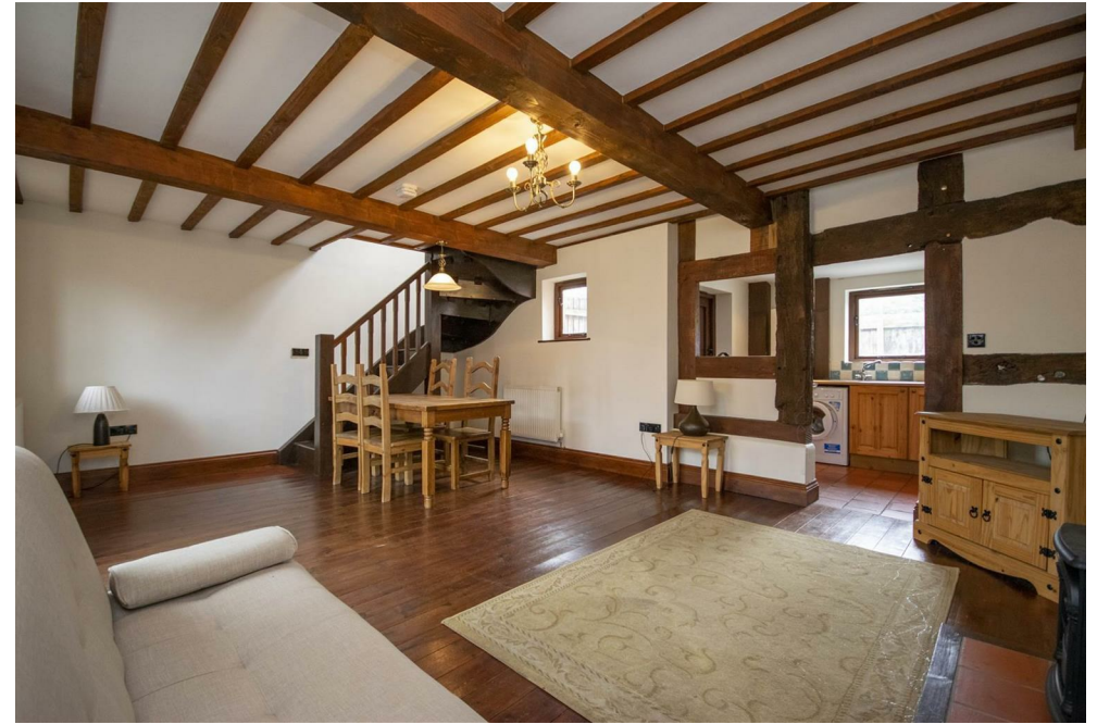
The Stables, Lower Netley Farm, Netley, Dorrington, Shrewsbury, Shropshire, SY5 7JY £695 PCM

A charming part-furnished 1 bed barn conversion